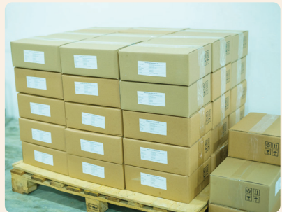
Readying Coconut Products for Exporting