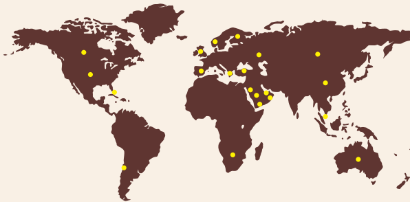
natureswellness Export Map

We are exporting to more than 20 different countries across the globe.